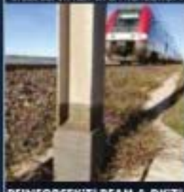
REINFORCEKIT® BEAM & DKIT®