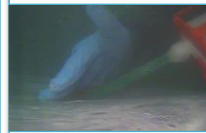
Primer & composite plate with filler application (steps 1 & 2)