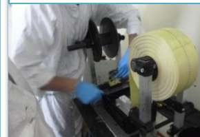
Tape impregnation using BOBIPREG & R4D-S wrapping (step 4)