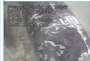
Pipe before surface preparation