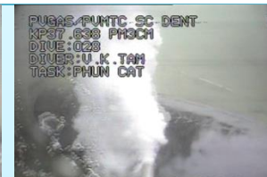
Sandblasting in progress