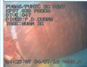
Repair overview & measurements